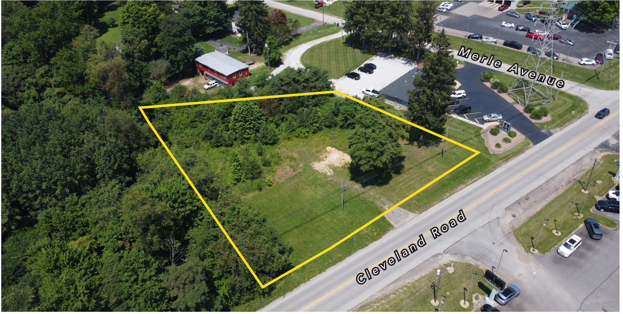
*Subject to Survey